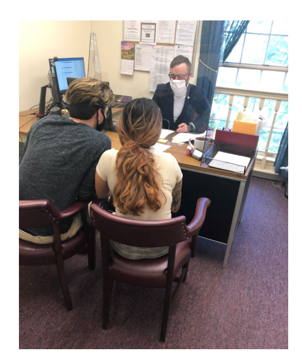
Figure 6. Case Navigator works in the Circuit Court for Carroll County during COVID-19