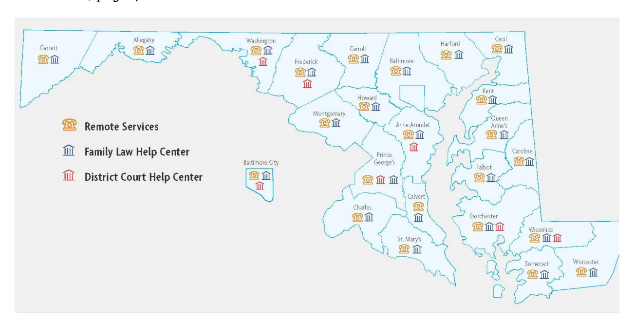
Figure 1. Statewide Help Center Interactive Map

Hours and location information should be clearly communicated to litigants, court staff, and justice partners. Court staff and justice partners should know where help centers are in their jurisdiction. Locations should be clearly posted on the court's website, and on www.mdcourts.gov. Program staff should use written materials such as flyers and posters, and the internet to communicate these important program details. See WEBSITES , page 42.