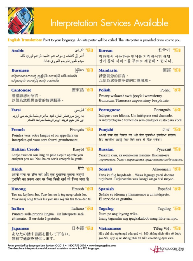
Figure 9. Language Link card.

Court help centers should display the Language Line Poster (PDF) or the I Speak Card (PDF) to help visitors indicate the language in which they need assistance.