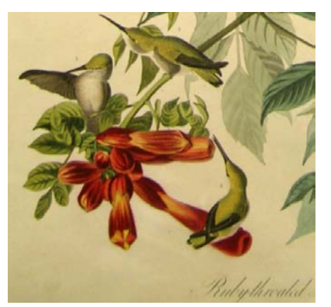
cont. on p. 10

Ridgely's effort paid off. The Maryland State Law Library's prints, now nearing completion of a much-needed conservation overhaul, are worth much more than $23,000. Though a formal