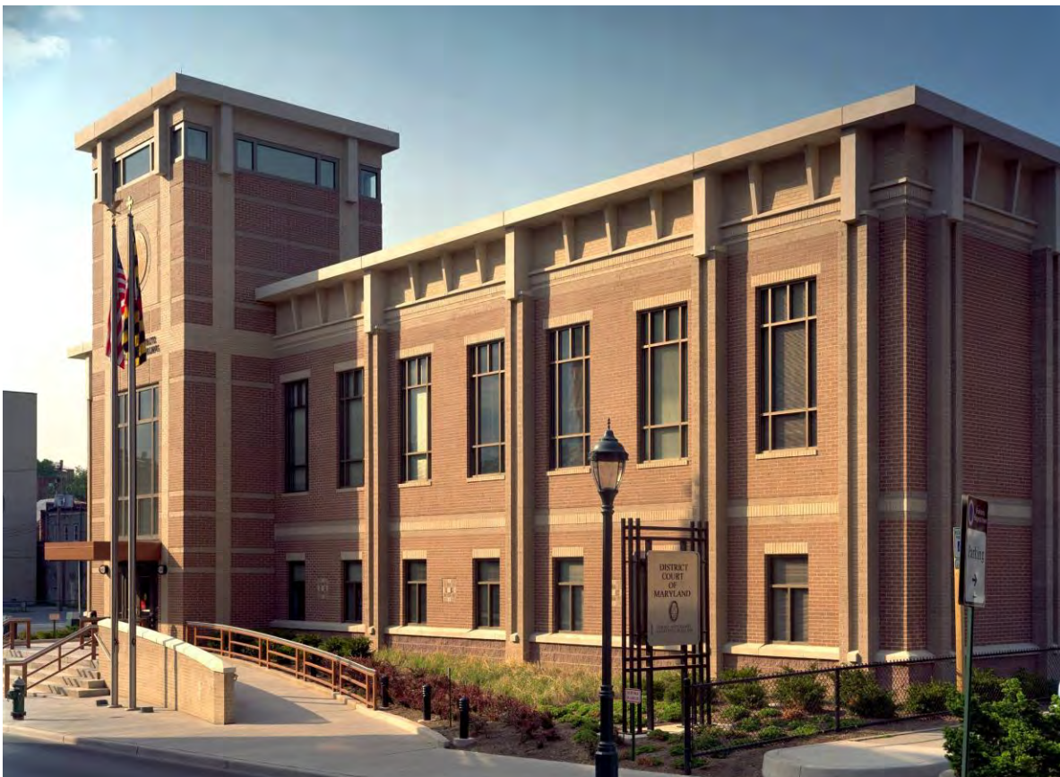
District Court of Washington County – Hagerstown Location

The following tables provide a statistical representation of the workload for Fiscal Year 2012 in the District Court.