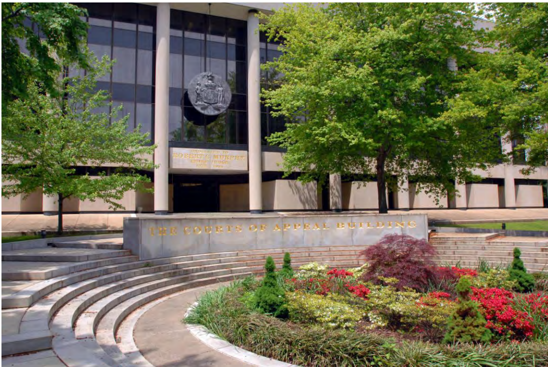
Robert C. Murphy Courts of Appeal Building Annapolis, Maryland

The following tables provide a statistical depiction of the Court’s workload for Fiscal Year 2012.