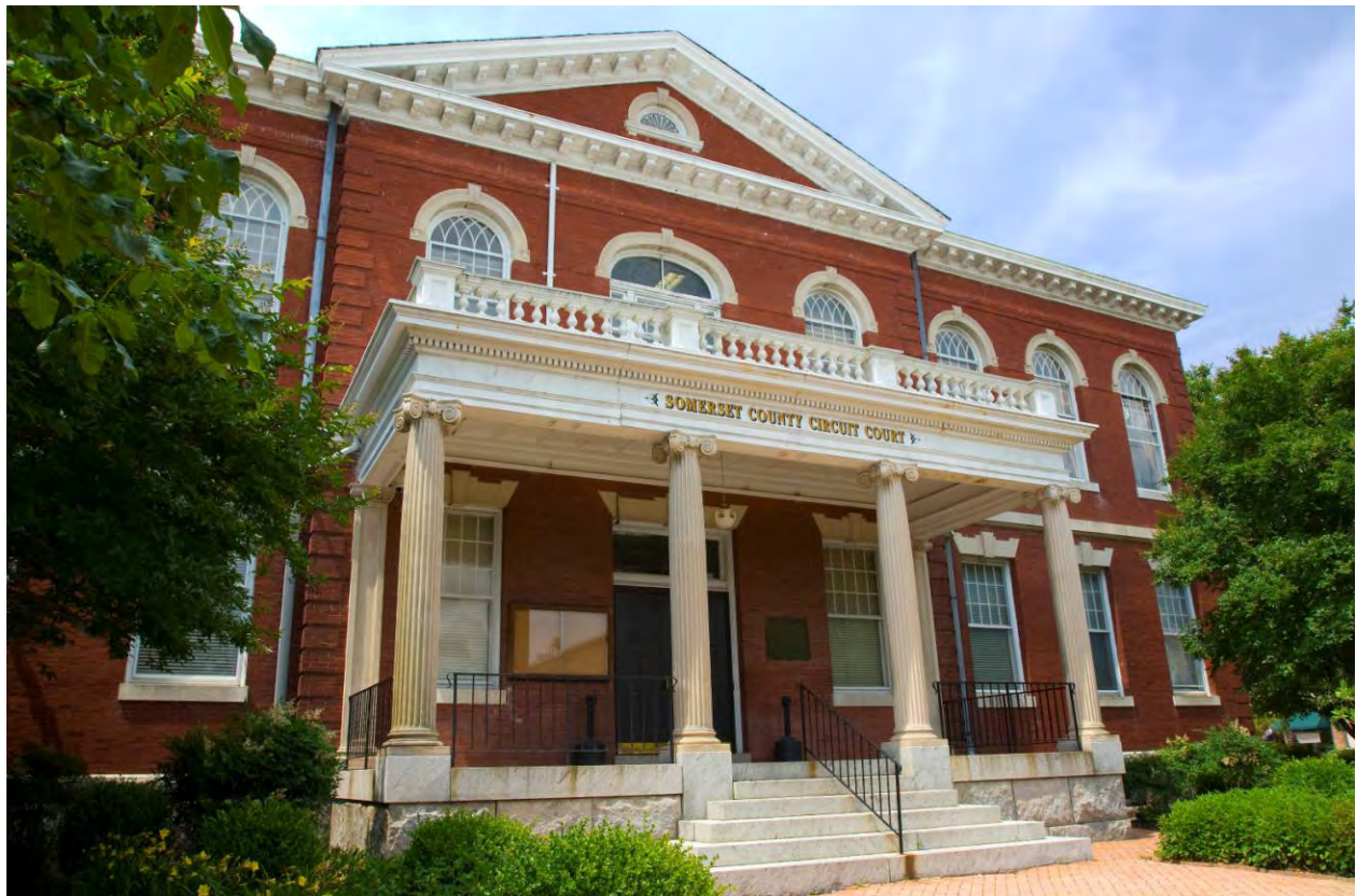
Circuit Court for Somerset County

The following tables provide a statistical depiction of the workload in the circuit courts for Fiscal Year 2012.