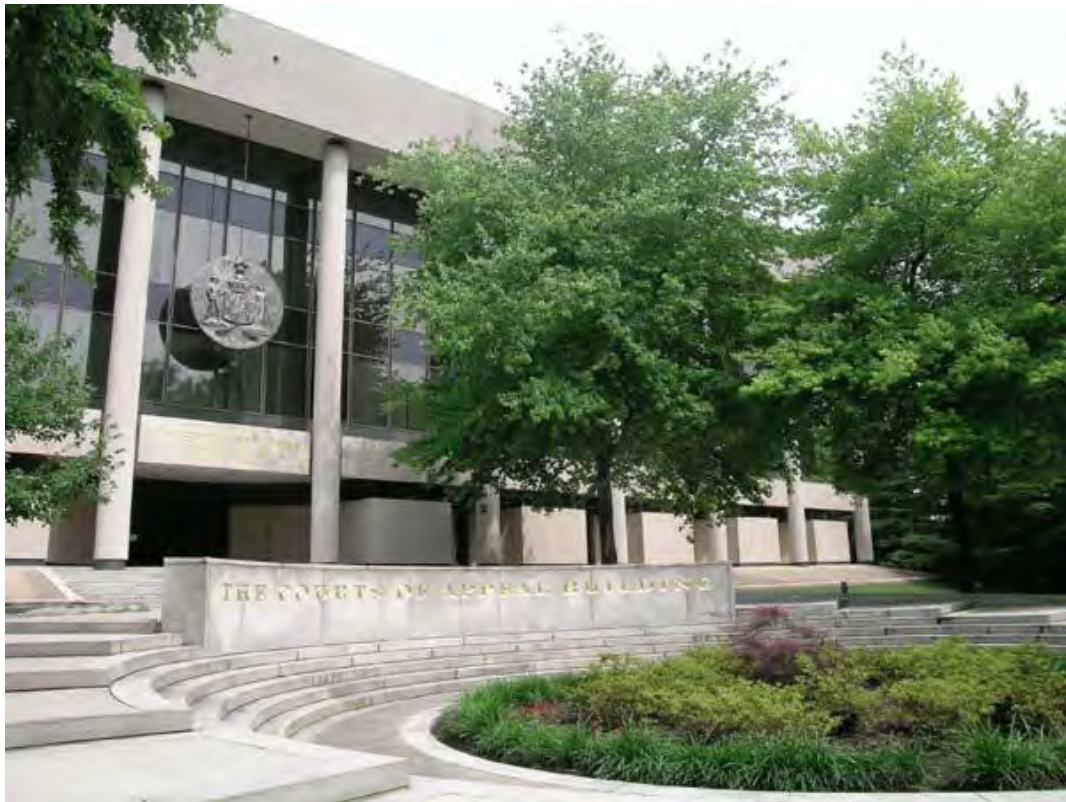
Robert C. Murphy Courts of Appeal Building Annapolis, Maryland

The following tables provide a statistical delineation of the Court’s workload for Fiscal Year 2012.