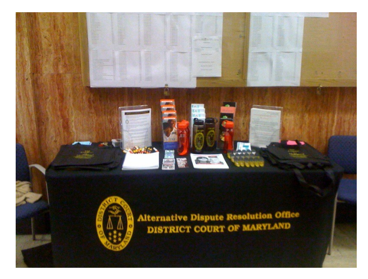
The District Court ADR Office hosts a Conflict Resolution Day event at the Baltimore City District Courthouse (Fayette Location).

Open House events included staffing display and information tables in public areas of District Courts to distribute materials about mediation and District Court ADR programs and services to the public and court employees. In some locations we were joined by our local community mediation center (CMC) partners who distributed literature about their local center. In other instances the local CMC provided their information for District Court ADR staff to distribute.