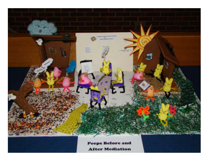
Conflict Resolution Center of Montgomery County was the proud winner of the PEEPS diorama contest.