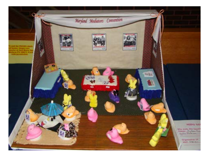
Maryland Judiciary's Mediation and Conflict Resolution Office (MACRO) PEEPS diorama.

participants through a series of scenarios involving potential ethical dilemmas. Using both small and large group discussions, participants shared ideas and reflected on whether the policies and procedures of a particular venue or entity may affect the appropriate response to the ethical dilemma.