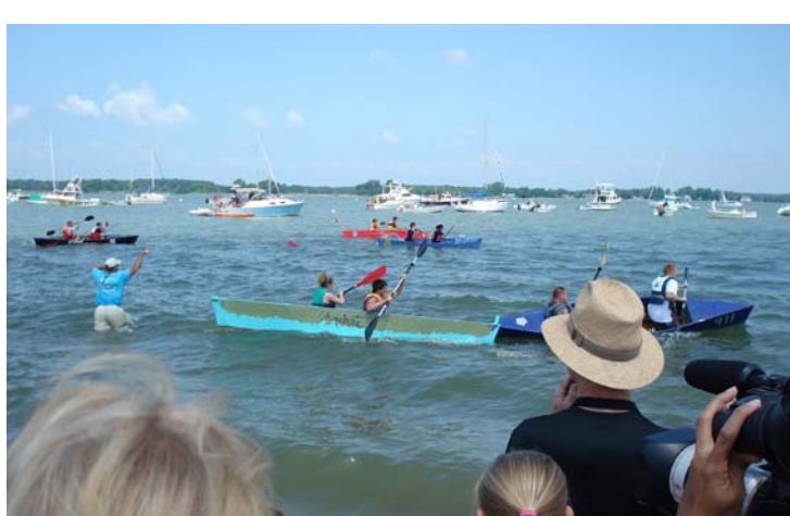
Talbot Co Juvenile Drug Court Participants in the Annual Cardboard Boat Race to support Special Olympics.

Drug Court teams involve community organizations nonprofit agencies, local officials,