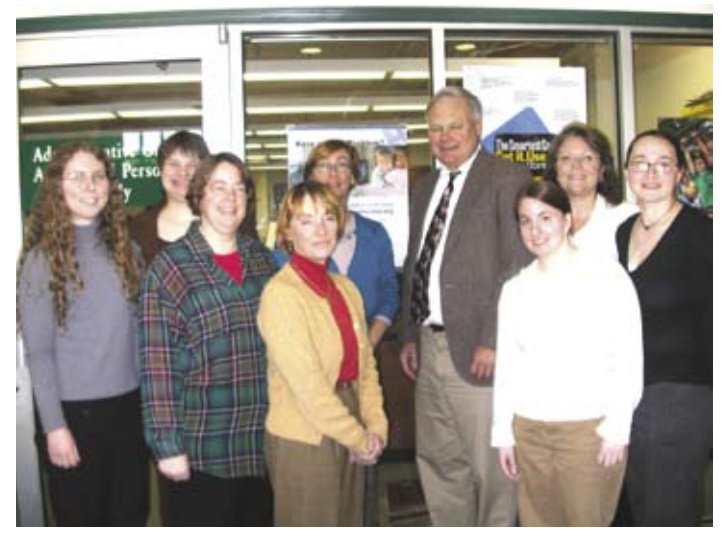
Judge Norton meets with Dorchester County librarians to plan the launch of the "Get Ready for Your Day in Court at Your Library" program.

supports the partnership because it can help the public be better prepared when they enter the courtroom, said Judge John L. Norton, III, administrative judge for District 2