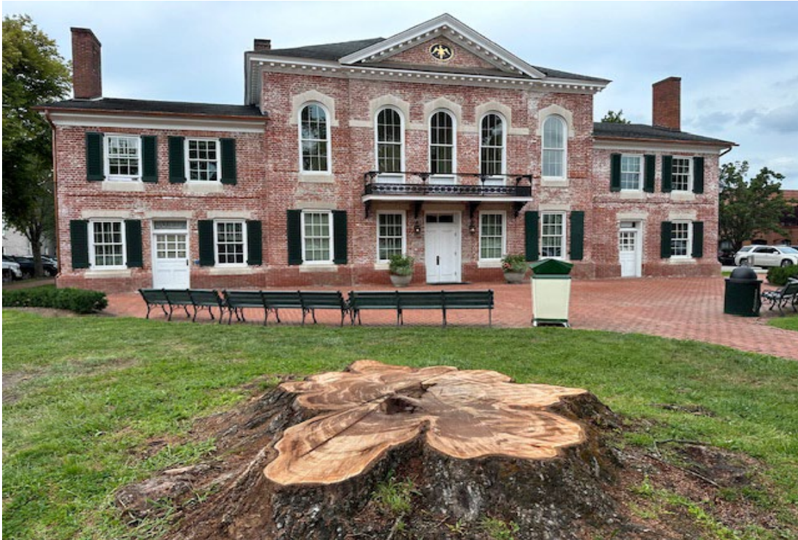
Circuit Court for Queen Anne's County Historic Courthouse

Renovations of the Historic Courthouse are due to begin in mid to late 2025, which will include upgrading the first floor, which will become the Orphans Court and Register of Wills Offices. The second-floor main courtroom will also be updated and will provide as a back-up to the existing Circuit Courthouse. The basement will consist of various offices, with hopes to incorporate additional space to utilize when needed.