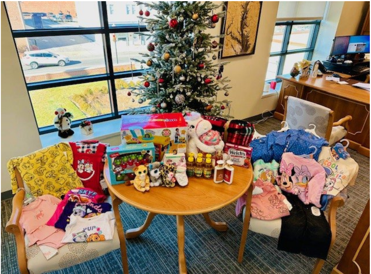
Adopt a family donation.

The Circuit Court for Queen Anne’s County Court Administration, along with the help of the Department of Social Services, participated in the adopt a family for the Holidays program. This heartwarming program provides support and hope to assist families in need during the Holiday season.