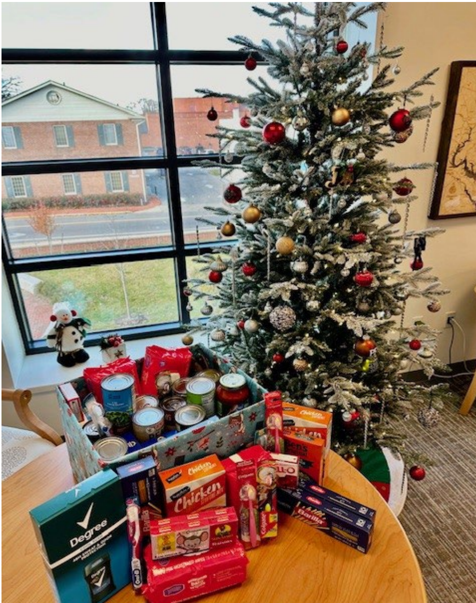
Haven Ministries Donation

In December of 2023, our Court extended support to our local community through the Haven Ministries Donation program. This program provides shelter, clothing, food and support to families in need. It is important to get involved and offer support, as it makes a difference to those who have experienced difficult times and the ability to give back to the local community.