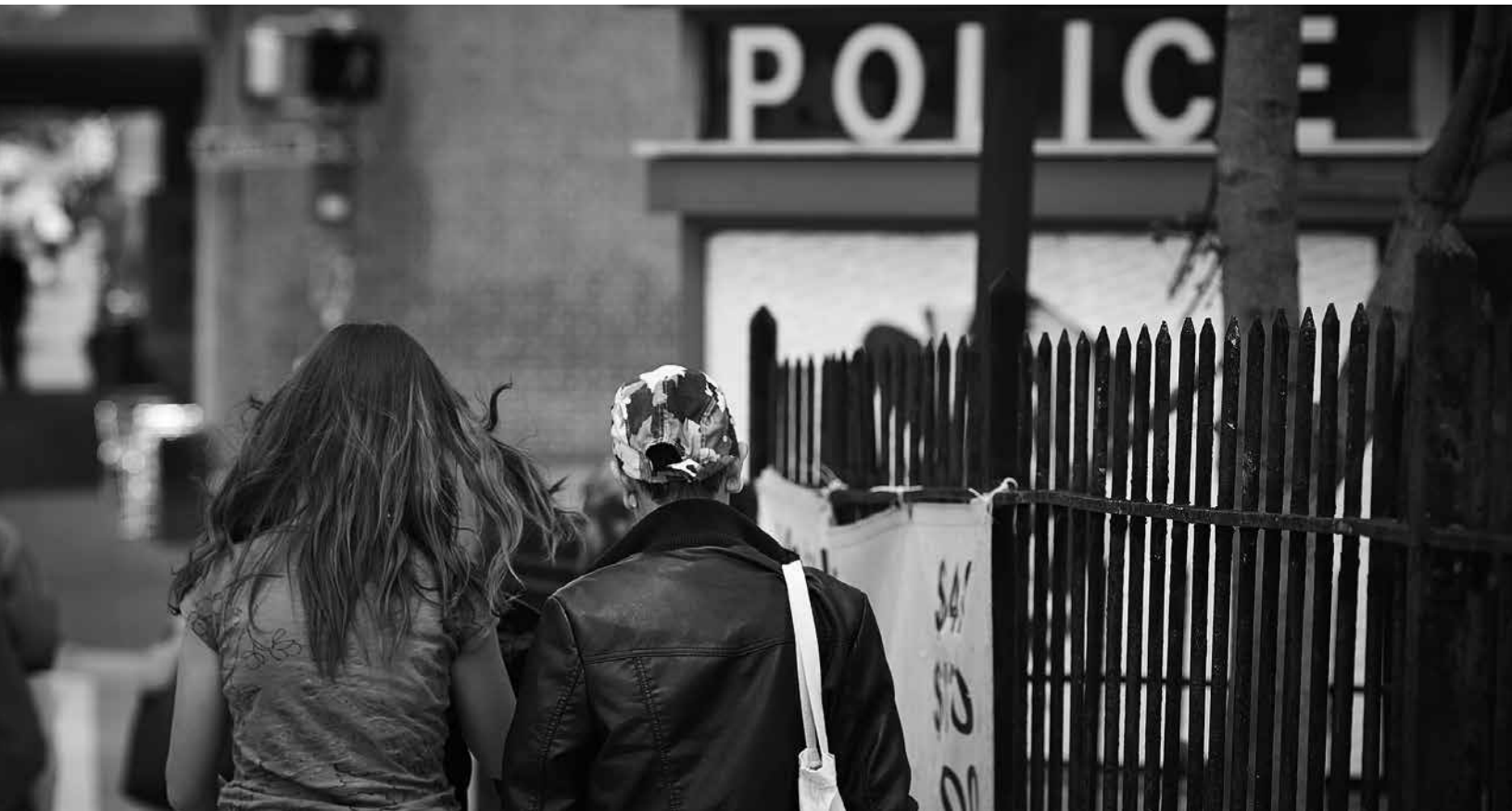
Feeling the weight of surveillance. In some communities, LGBTQ youth feel expression of one's sexuality or gender identity are policed and criminalized, when youth feel that these expressions should be viewed as typical adolescent and human behavior.

LGBTQ youth make up a large percentage of the homeless youth population and are more likely to be arrested. A national study found that 39% of homeless LGBTQ youth have been involved in