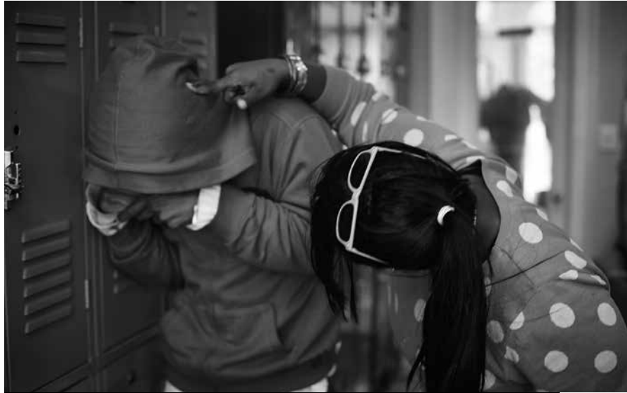
Bullying at school. While all Maryland schools have adopted anti-bullying policies, some are so generic that the needs of LGBTQ students, especially transgender and gender non-conforming youth, are not effectively addressed, while others are so punitive, attempts to protect oneself are penalized.

In Maryland's schools, approximately 80% of LGBTQ students reported experiencing verbal harassment from peers because of their sexual orientation. 17 Nearly 60% of students surveyed have endured name calling and threats in response to their gender expression. 18 Survey responses indicated that 30% of students had faced minor physical harassment such as being pushed or shoved, while 10% received more serious injuries, such as having been punched, kicked, or injured with a weapon. 19 Approximately 40% of students reported damage to personal property such as cars, clothing, and books. 20 Sexual harassment was a problem for 60% of the students responding to the survey. 21 Electronic harassment or "cyberbullying" was reported by almost half of the respondents. 22