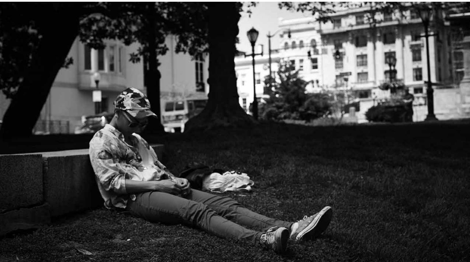
Resting in a public park. Homeless youth are often subjected to discriminatory community policing practices that can lead to harassment of youth sleeping, sitting, or lying in public spaces. Youth found without identification can lead to police wanting to “help”, which may or may not result in a bed in a shelter. For LGBTQ youth, a night in a shelter might not be a safe option. In other communities, law enforcement response may include an immediate trip to jail.

The Youth Equality Alliance believes that Maryland should lead the way by implementing protections that go beyond PREA and specifically address all safety and dignity concerns for LGBTQ youth. Policymakers, advocates, social workers, and others must take immediate steps to create clear policy directives to protect LGBTQ youth, comprehensive trainings for all personnel who interact with LGBTQ youth, and resources that are better tailored to meet their needs. We urge that youth be at the table as these policy directives are developed.