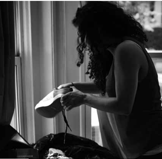
Sifting through donations in shelters and community centers is a common task for LGBTQ youth forced to leave their families or run away, hopeful of finding safety and security in the next out-of-home placement.

Meaningful change is possible, and resources and models exist to provide guidance. Advocacy organizations have developed a number of tools that provide comprehensive training to families and professionals working with LGBTQ children in foster care. 77 The Child Welfare League of America has published the “CWLA Best Practice Guidelines for Serving LGBT Youth in Out-of-Home Care”. 78 The Best Practice Guidelines are based upon the Model Standards Project, initiated in 2002 by Legal Services for Children and the National Center for Lesbian Rights to develop and disseminate model professional standards. 79 The goal of the Model Standards Project is to improve youth outcomes by giving child welfare and juvenile justice agencies accurate, up-to-date information about the best practices for providing competent services to LGBTQ youth, based on the knowledge and practical experience of experts in the field. 80 The Department of Health and Human Services has issued guidance for improving care of foster youth by all child welfare systems. 81