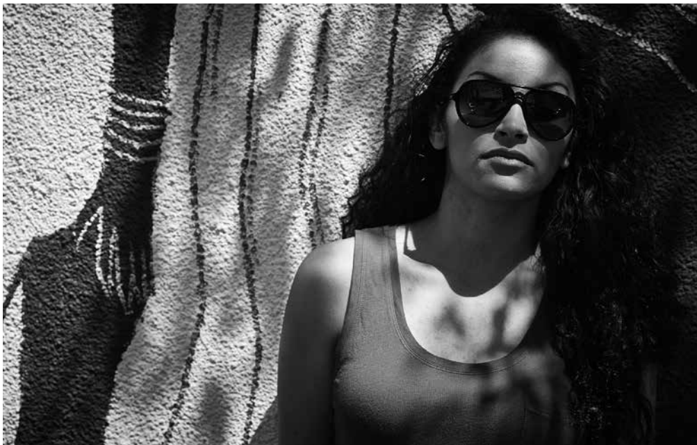
Living in the margins. LGBTQ youth, both homeless and non-homeless, seek spaces where they can be authentic to themselves and others, but often spend more energy not drawing attention to themselves, especially when safety and daily survival are pressing issues. Trying to look cool, fit in, and avoid harassment are the goals.

Court involved LGBTQ youth risk permanent records if they ultimately become involved in the criminal justice system. It is widely acknowledged that the effects of a criminal record can be far reaching and severe, creating barriers to employment, housing, and educational achievement. If incarcerated, youth lose momentum in attaining their education, and are less likely to finish high school or pursue earning high school equivalency degrees. LGBTQ youth convicted of felonies can lose access to desperately needed resources such as transitional housing, educational funding, and job development services. Already vulnerable individuals can face economic and social isolation, which are key risk factors for community health issues such as domestic violence, poverty, and criminalization. It must be noted that these risk factors are further intensified by the intersections of race and class.