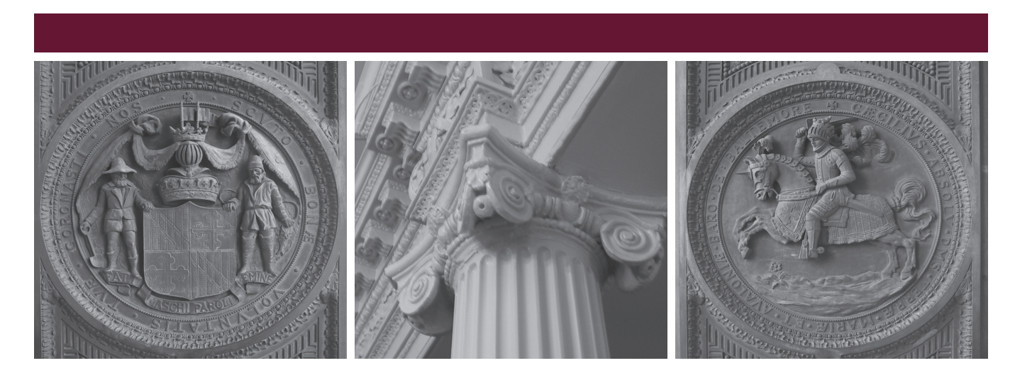
DEPARTMENT OF LEGISLATIVE SERVICES 2015